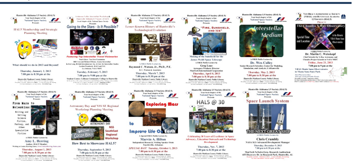
HAL5 2013 Monthly Program Flyers. Please Visit Our Website at www.HAL5.org for Larger Sizes and Past Flyers.

HAL5 typically holds public lectures or membership meetings on the first Thursday of every month at the Huntsville–Madison County Main Public Library Auditorium, followed by socials at local restaurants. As a thank you to our guest speakers, their meals at the post-program social are paid for by HAL5.