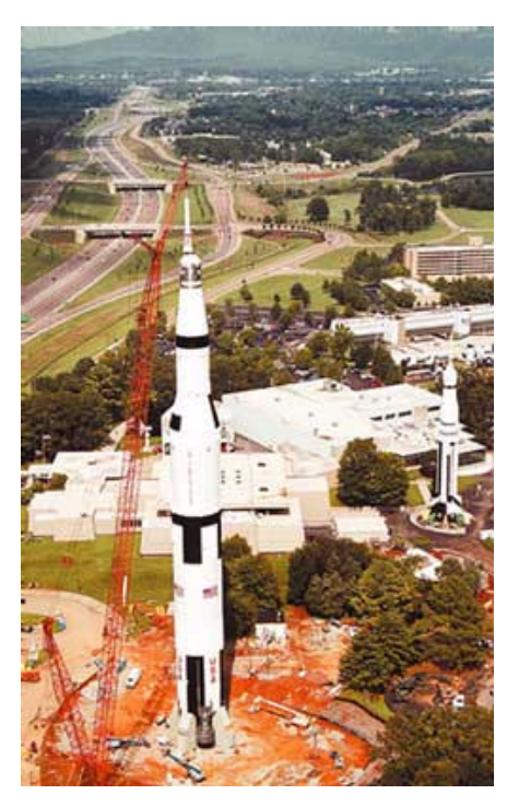
The Saturn V standing tall once more. (Smaller Saturn 1B is in the distance.)